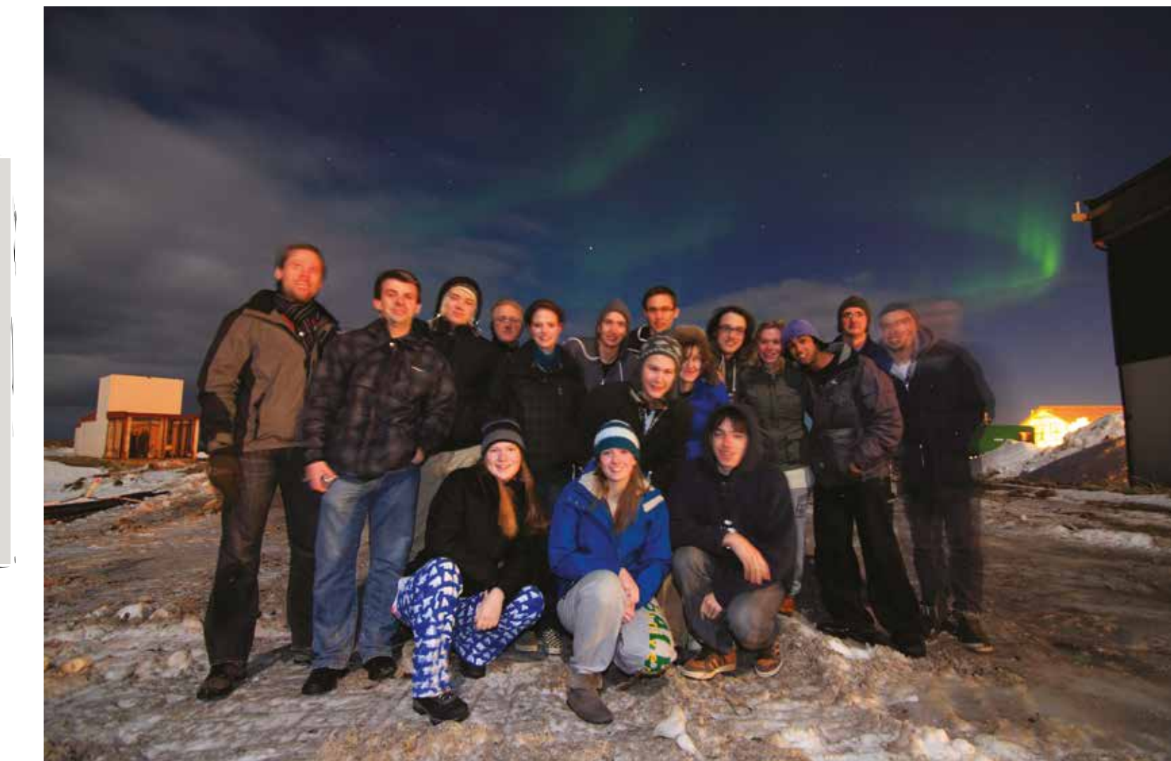
An introduction to space research taught at a rocket range under the aurora.

Objective: "Attract undergraduate students and bridge them into space related graduate study or the aerospace industry."